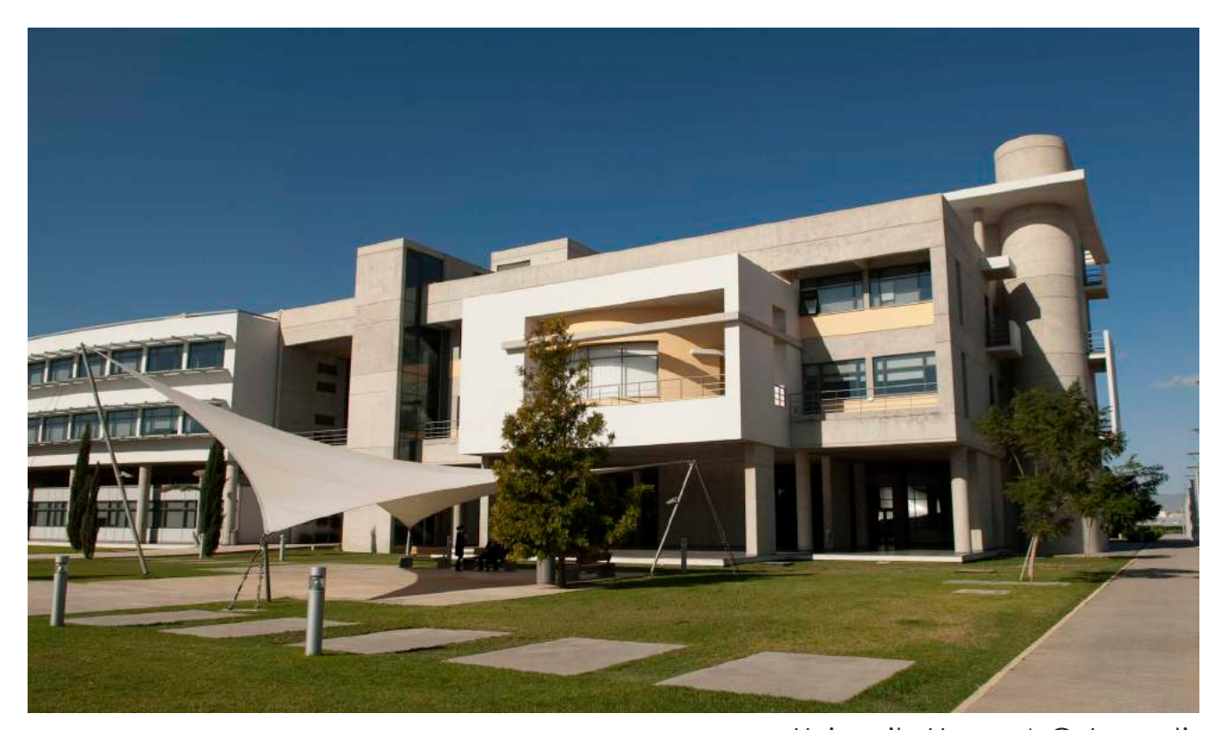
University House A.G. Leventis

The paper changes the picture of a static, whitedominated perspective of BME-CRT by offering a dynamic, fluid discourse involving East Asian academics' positional identities and their broader comparative implications beyond the UK.